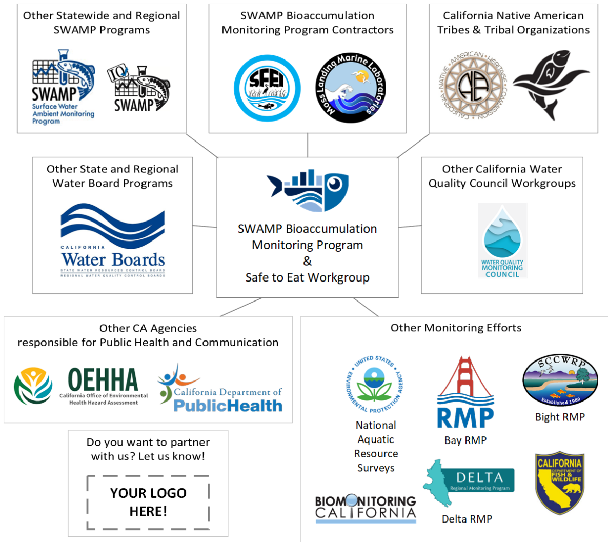
Figure 5.1: Network map of STEW and Program partners